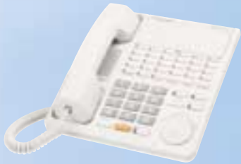
KX-T7425 (black & white) Speakerphone Set