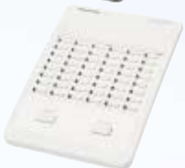
KX-T7441 (black & white) DSS Console