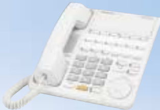
KX-T7420 (black & white) Speakerphone Set