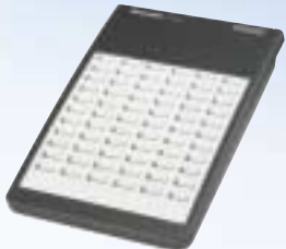
KX-T7440 (black & white) DSS Console