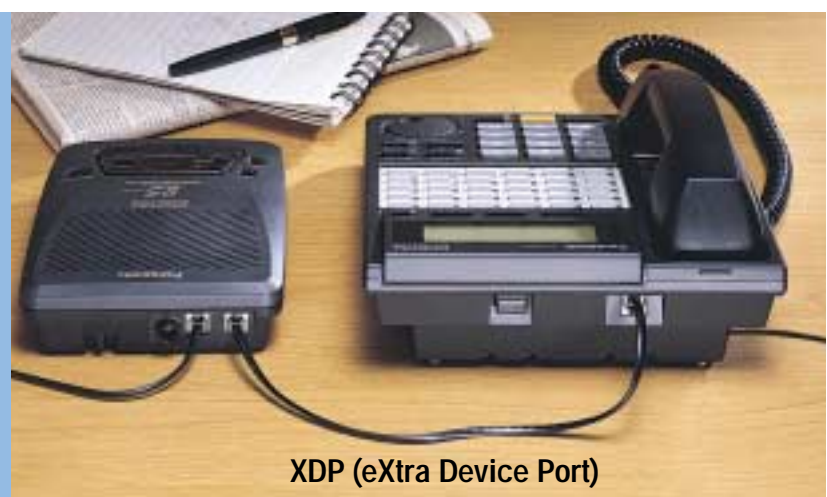
XDP (eXtra Device Port)