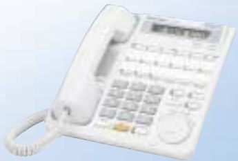
KX-T7431 (black & white) Speakerphone with 1 Line LCD Display