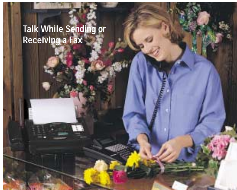
Talk While Sending or Receiving a Fax