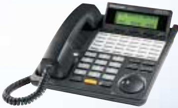
KX-T7453 (black & white) Speakerphone with 3 Line Backlit LCD Display