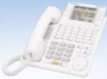
KX-T7456 (black & white) Speakerphone with 6 Line Backlit LCD Display