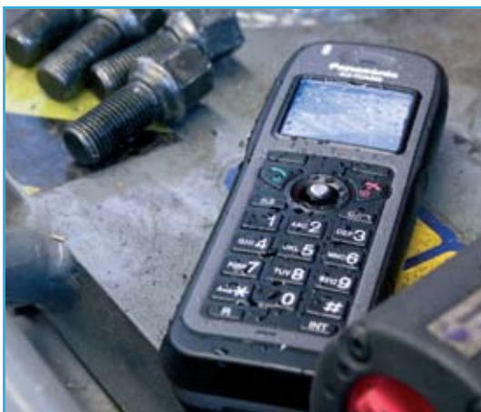
Shock-Resistant, Ruggedized Design

The KX-TD7696 boasts a large, 6-line, blue backlit LCD and includes all the features you'd expect such as Caller ID, personal and system speed dials, and a built-in 100-entry phone book and distinct ring/LED options. The handset includes an intuitive Graphical Icon Menu and dynamic Operation Guidance with Soft Keys and a Built-in Joystick.