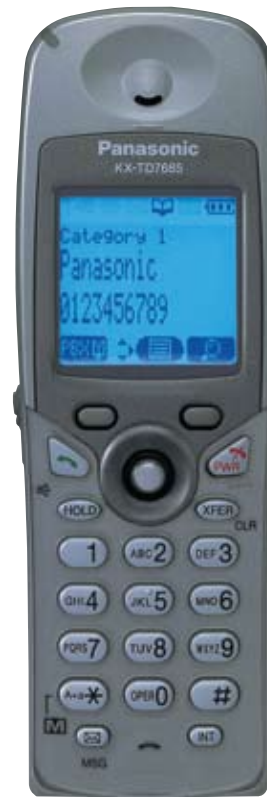
KX-TD7685 Standard Model