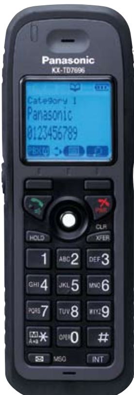
KX-TD7696 Ruggedized Model