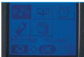
Blue, Backlit Display

Customize your DECT handset with individual ringtones so you'll instantly know who's calling or to differentiate internal versus external calls or even an internal phone group. In mute mode, the 3-color LED will show you who's on the line. Just set up a different color for each incoming call.