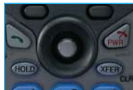
Easy Menu Operation