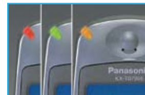
LED Call Indicator