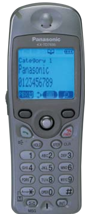
KX-TD7695 Compact Model