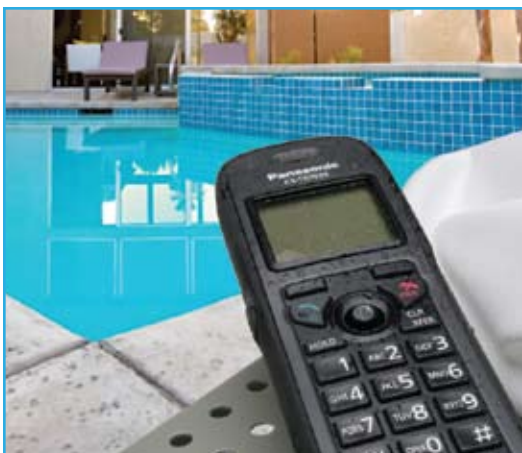
Dust & Splash Resistant